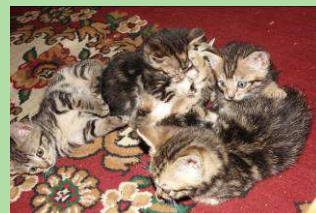
8 sweet, tiny kitties