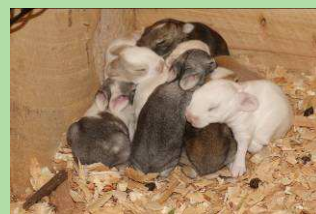
Some little rabbit babies