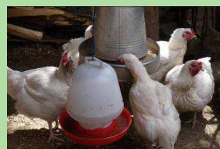
Dani's Broiler – 7 kg each !!!