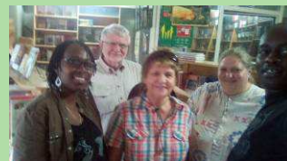
At the Nakuru Bookshop of Scripture Union Kenya