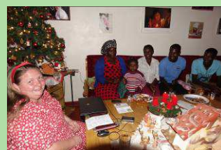
Our Christmas Party