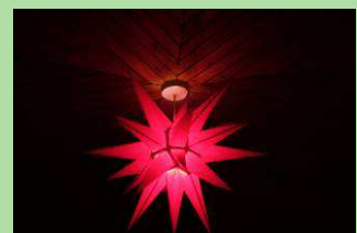
A star as a lamp holder