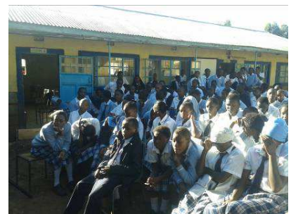
86 out of 122 Secondary Students started a new life with Jesus (St. Francis Upperhills)