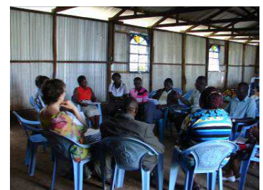
Kiratina –Fellowship 19th of March 2016