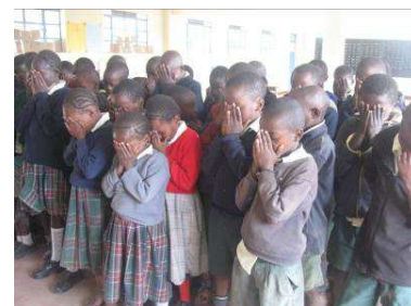
Pupils of Standard 4. + 5. asked God for forgiveness (Kamoronyo Primary School)