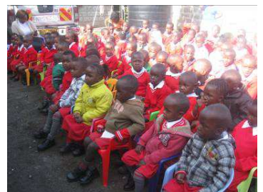
Nursery Children watching an Easter Cartoon Movie (Echoes of Joy)