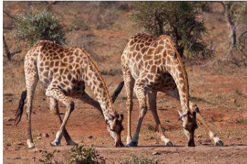
What about you? Holidays at Kenya?