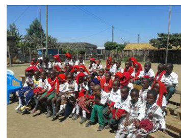
Pupils of Standard 4 and 5 watching the Jesus-Movie „Man of the 1000 Miracles“ (Good Morning Academy)

That took more time than I have thought, because sometimes I had to go three or four times to one school till I found someone in charge... But I had many very nice meetings with the directors and head teachers. All schools wanted me to continue the way I need last year. I got a lot of positive feedback. The head teachers were happy that I found the time to sit with them and to share; sometimes we had fellowship even for more than two hours. Here in Africa it is very important to have a good contact to the school leadership because they are the one allowing me to spread the Gospel in their schools. Therefore these times of fellowship were very important.