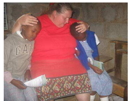
Prayer during Individual Counselling (Mereroni Primary School)