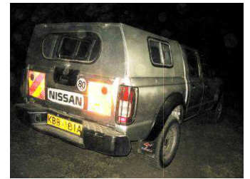
The new Cover from our car

Some of you already know that during my driving from school to school the back cover from our pickup was falling down and got spoiled. God was protecting me here a lot because nobody got hurt, I did not spoil any other things... and a fundi who helped me was very close... Now I want to thank everybody who was helping us financially to get a new cover from metal which has also a good lock. Thanks a lot for your help!