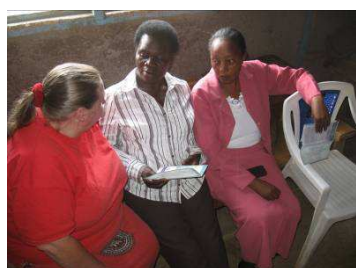
Conversation with some Teachers (Kianda Primary School)