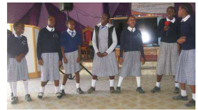
Nakuru Teachers Primary School presented a drama about "Ananias & Saphira"

On the 5th of March 2016 there was a Bible Club Rally at Kiratina. Our motto was "Peter - The Apostle of Jesus Christ". 199 children and 6 teachers had come from four different schools and also some Sundayschool children of ACK St. Paul (our host). The schools were presenting dramas and songs about the life of Peter. Between the presentations we made some competition games about "Peter- The fisherman". It was a wonderful morning.