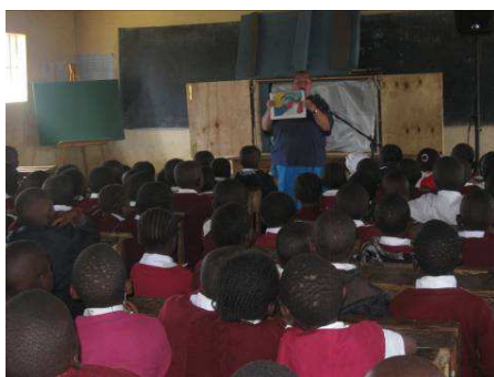
I was teaching the nursery children about Easter by using Kiswahili (Tabuga Primary School)

In 7 schools I am able to do the follow up work by myself when I will come for the Bible Clubs next term... In the other 7 schools I am depending on the assistances of the teachers... Please pray especially for those children who started a new life with Jesus that they are able to grow in the faith and one day become mature men and women in Christ!!! For me that is the most important thing of all!!!